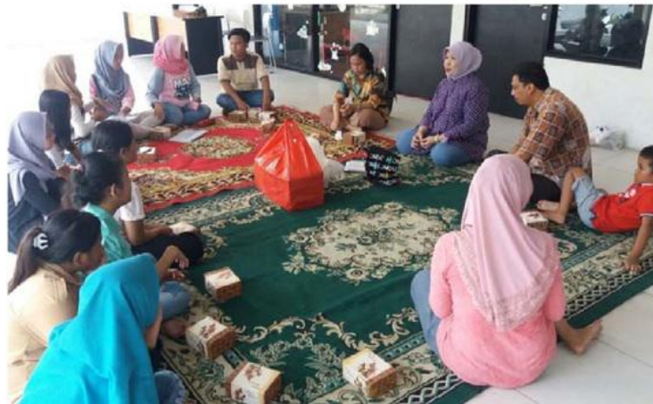
Figure 3. The socialization of the development of adolescent characters behaves healthily at RPTRA Matahari

Phase 4 is a socialization of the development of youth character in healthy behavior. This activity is carried out to remember to adolescents that healthy living behavior will help teens from being addicted to pornography. This activity was carried out on October 14, 2017 at RPTRA Matahari, Maphar Village, Taman sari District, West Jakarta.