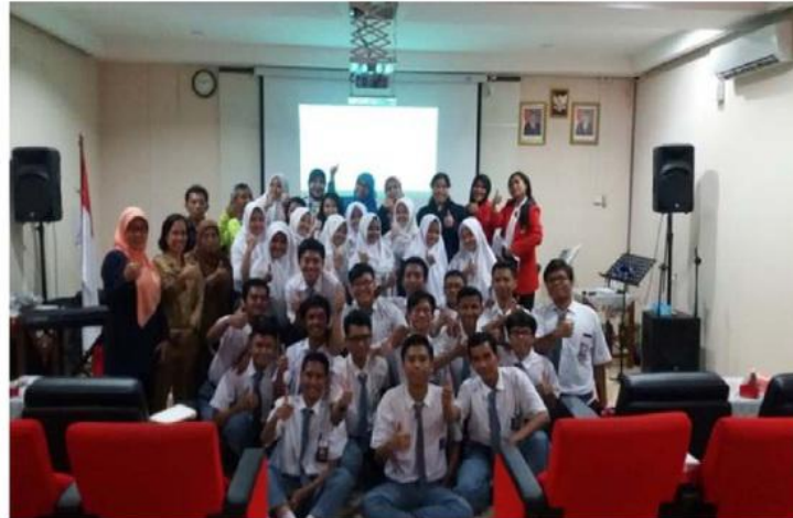
Figure 2. Socialization and education of brain damage due to pornography in the Hall of SMAN 17

Phase 3 is a literacy of curative and preventive actions related to pornography addiction. At this stage, what curative and preventive actions should be explained should be done so that individuals understand and can anticipate addiction to pornography. This activity was carried out at SMAN 17 on October 31, 2017.