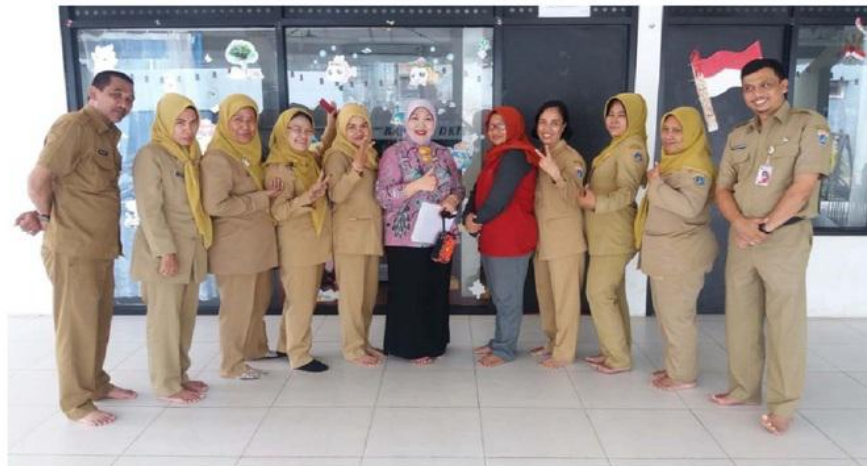
Figure 1. Social mapping related to pornography and determination of location of activities at RPTRA Matahari